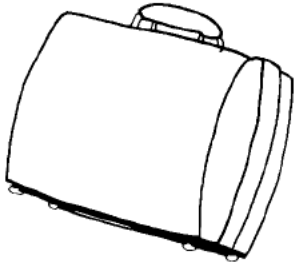
Large Suitcase 45 pounds