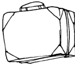
Small Suitcase 30 pounds