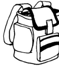
Backpack 17 pounds